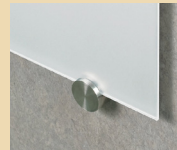
Edge Grip Standoff